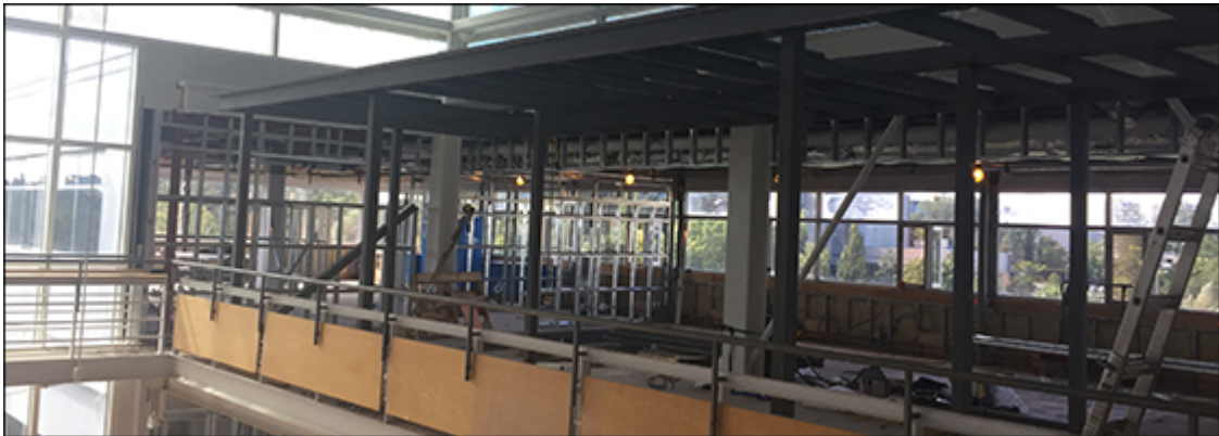
Third floor, southwest view.

Throughout the summer to early fall, much of the work on the OAA Headquarters focused on the mechanical systems. Interior spaces are now taking shape quickly. These include the second-floor boardroom, meeting rooms and atrium café space, in addition to the open offices and meeting/collaborative spaces on the third floor.